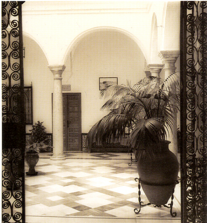
Top left: Lucca No. 2, Toscana , 2005, toned gelatin silver print, 15" x 15", edition of fifty. Right: Ronda No. 4, España , 2005, toned gelatin silver print, 18.5" x 6.25", edition of fifty. Bottom left: Arcos de la Frontera, España , 2005, toned gelatin silver print, 19" x 19", edition of fifty.